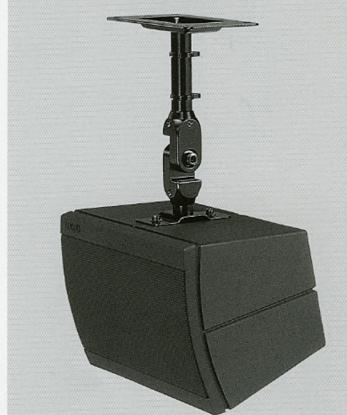
BWS20-120/190/260 Wall Bracket