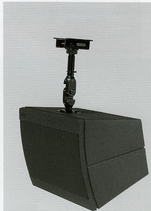
BCS20-150/210/270 Ceiling Bracket

Whether you want to mount the S15 or S55 on a wall, ceiling, or stand, there's a mounting option that will do the job. Free-angle wall- and ceiling-mount brackets let you set the speaker at any angle for optimum sound and coverage. There's also a bracket for stand mounting that makes it easy to position the speakers anywhere at the optimum height. All these options mean that temporary or permanent installation can be carried out quickly and easily in any environment.